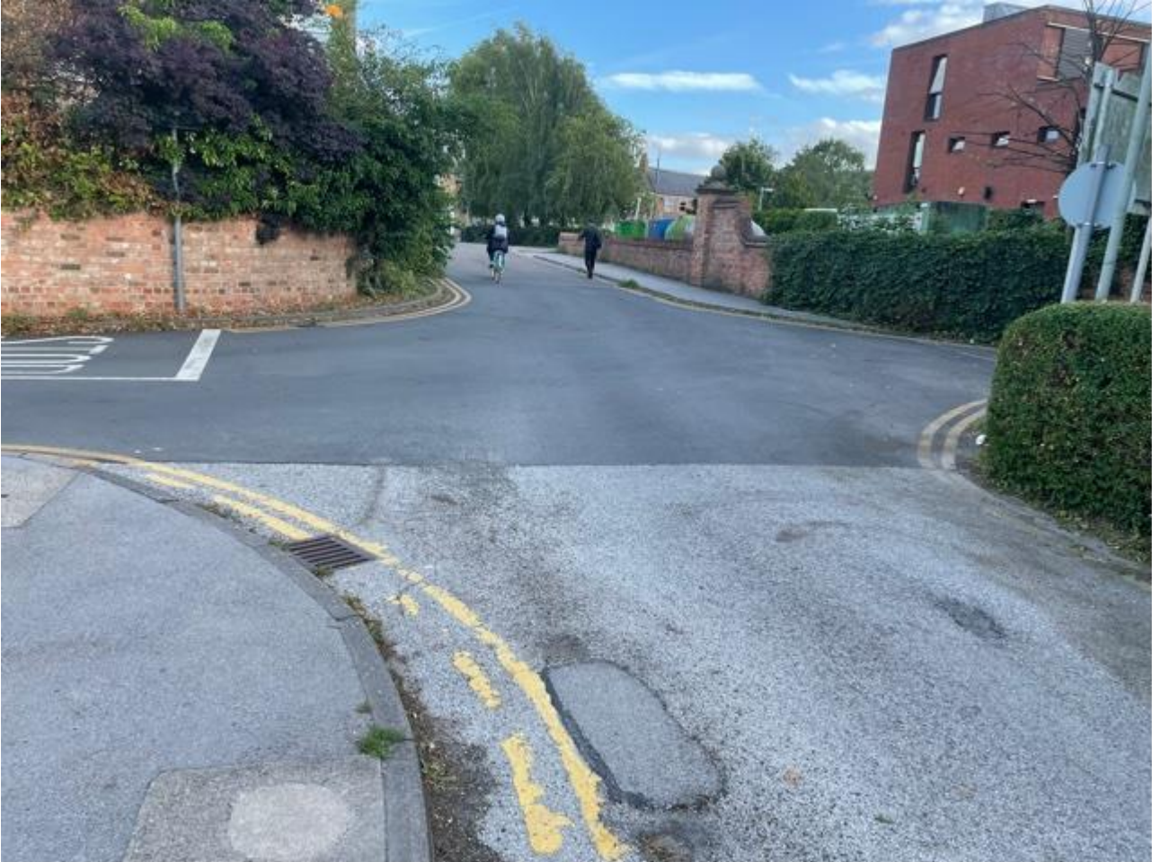
Picture: The Accessway